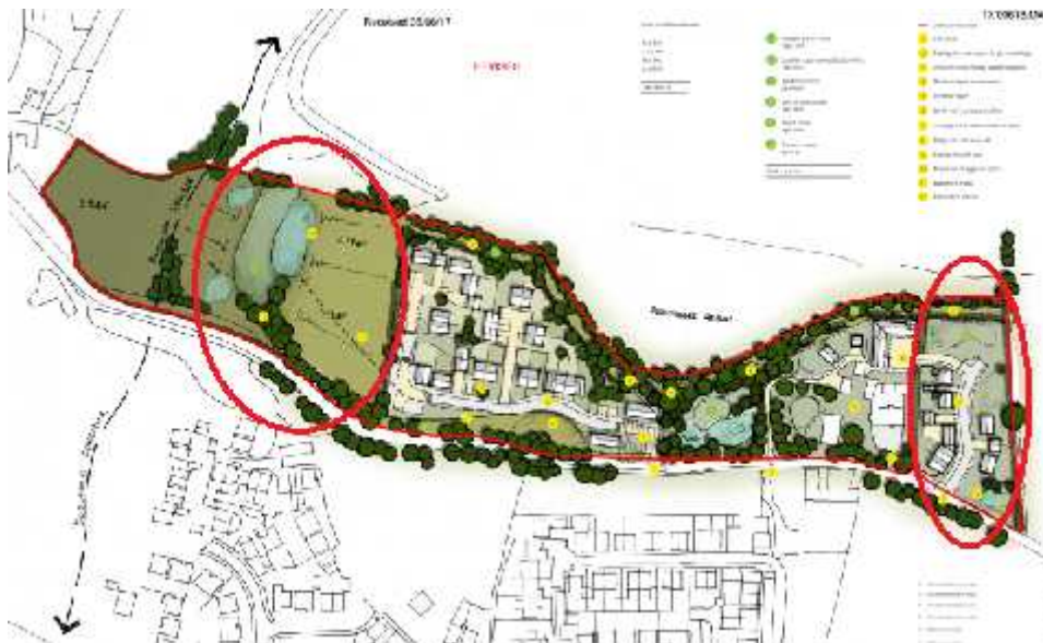
Figure 2: Illustrative Site Layout as submitted by the applicant illustrating how the development areas have swapped due to the topography of the land.

3.16 The applicant engaged in early pre-application discussions with the Council, where it was noted that the most western parcel of the site (within the allocation for mixed use development) was constrained for development due to the steep topography in that area of the site. It was considered acceptable in principle that the eastern-most parcel be used to compensate for the loss of development land to the west, with these fields effectively doing a swap. Therefore, development is proposed to the east and green infrastructure to the west. This is illustrated in Figure 2 below.