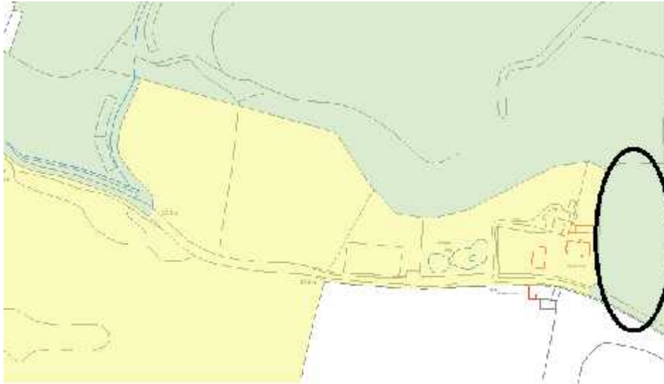
Figure 1 - Local Plan Allocation showing far eastern parcel allocated as Green Infrastructure

3.16 The applicant engaged in early pre-application discussions with the Council, where it was noted that the most western parcel of the site (within the allocation for mixed use development) was constrained for development due to the steep topography in that area of the site. It was considered acceptable in principle that the eastern-most parcel be used to compensate for the loss of development land to the west, with these fields effectively doing a swap. Therefore, development is proposed to the east and green infrastructure to the west. This is illustrated in Figure 2 below.